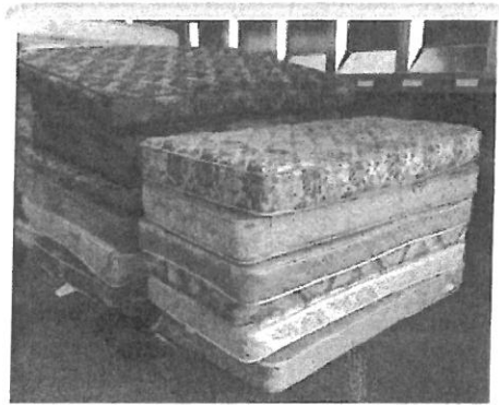
Mattresses stacked for recycling