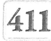
Johnston Community Updates