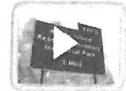
Location & Directions