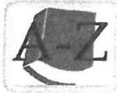
A to Z List